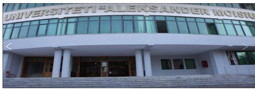
The hall of the Currila campus

Currila Campus – this space includes one library and four laboratories. It is the main campus hosting the administrative and academic staff from the following faculties: Faculty of Political Sciences and Law, Faculty of Information and Communication Technology, Faculty of Professional Studies, Faculty of Education, and Faculty of Political and Judicial Sciences. During the academic year, with the overall aim to be close to the students, these faculties will be located at the newest campus in the Spitalla Area.