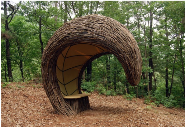
Tim Norris <Forest Wave Shelter>