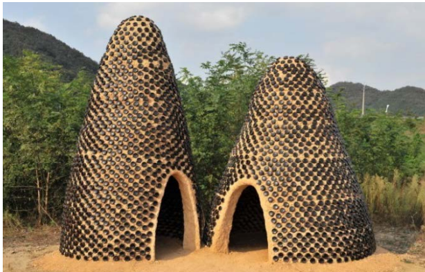
Manoir de Myriam <Contrasts and passages>