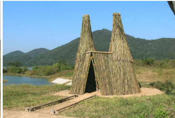
Manoir de Myriam <Geumgang Dialogue>

- Please have a look at www.natureartbiennale.org