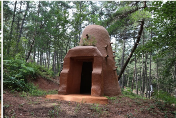
Ko Seung hyun <Contemplated Space>